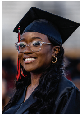
Continued on page 2...

This year, the work begins as we implement phase one of our strategic plan. We will climb that next mountain with a rapidly growing and changing community. Last year we reviewed