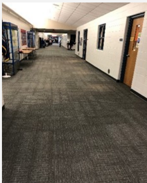
Endeavor Elementary has new, updated carpet!

The Administration Building has completed its first phase of construction on the new, state-of-the-art Community Collaboration Center. Crews will continue to work over the next few weeks. The new center will serve as a hub for the District. This technology-based, teacher (and community) focused training center will foster creative collaboration throughout. Anticipated completion of this project is mid-April.