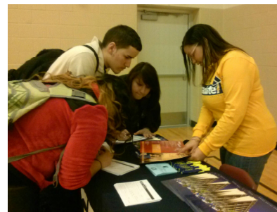
Students looking at Career Fair information.

On April 18, the ARCH program went downtown to the Planetarium, and on April 25, some ARCH students were rewarded with a trip to Chicago where they visited the Shedd Aquarium and had a special dinner.