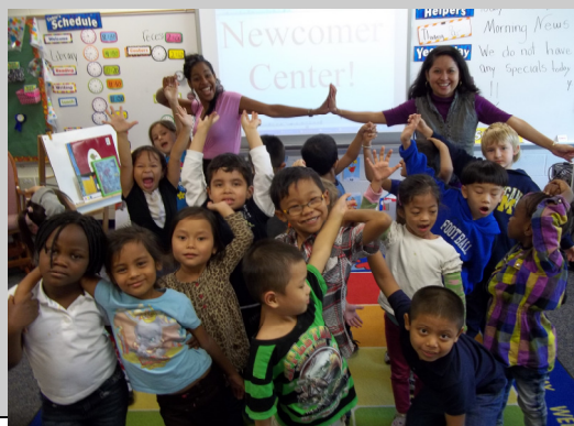
Below: Just having fun for the camera