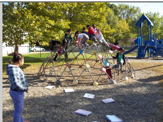
Above: Learning names for playground equipment and the verbs associated with them.

The goal of the program is to develop the students' language skills so that they will be able to participate fully in their grade-level classrooms in succeeding years. As they are working on basic language skills, they are also following the Common Core Curriculum Standards and grade-level content expectations. As children learn the English names for playground and school items, they are also learning the more rigorous academic language of the content areas.