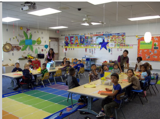
Above: Writing in our journals