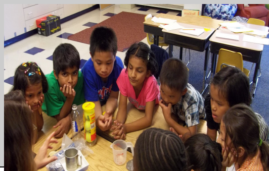
Below: Learning about mass and weight in science class.