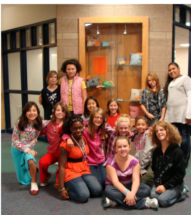
Participants of the Sewing Circle proudly display their projects.

This fall, Southwood Elementary offered a four-week extracurricular class to 5th grade girls, called the "Sewing Circle." The focus was to introduce the students to basic sewing instruction including hand stitching, threading needles, making knots, and sewing on buttons. Students also had the opportunity to use sewing machines allowing them to see how the machines work and the difference between sewing by hand and machine stitching. This was the first exposure to sewing for most of the students.