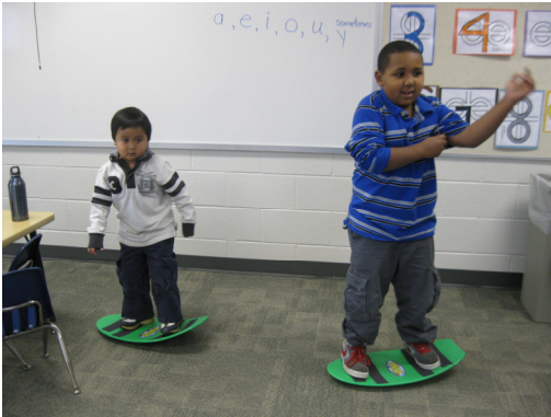
Second graders using the Action-Based Learning Lab to activate their brains.